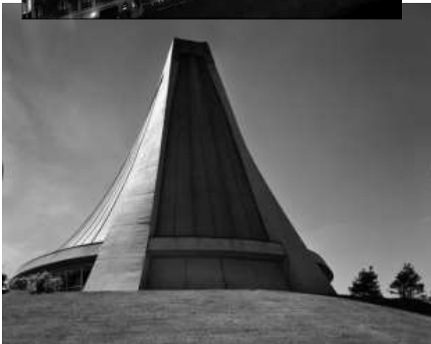
Temple Beth El, Bloomfield Twp

His life and building projects, including Northminster, were highlighted in an extensive article in the September/October issue of Michigan History Magazine, as well as a September 14 piece in the Detroit Free Press that online readers can view HERE .