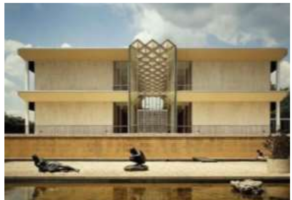
Wayne State University, top: College of Education; bottom: McGregor Memorial Conference Center