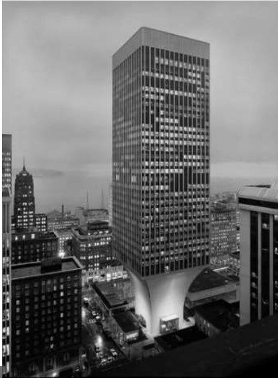
Rainier Tower, Seattle